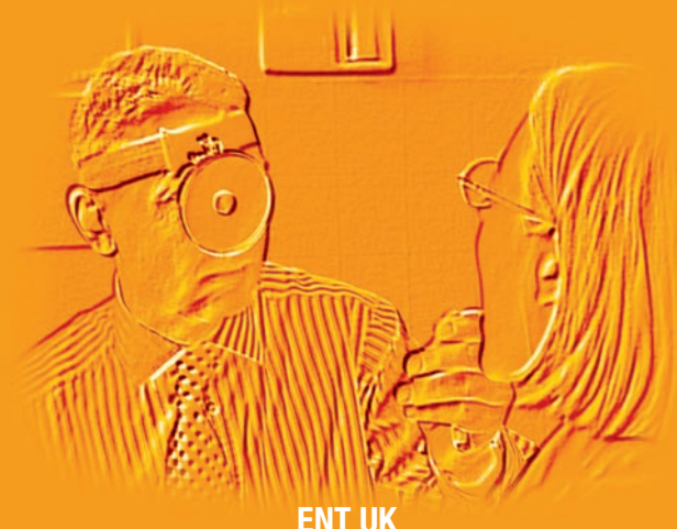
The Royal College of Surgeons of England 35-43 Lincoln's Inn Fields London WC2A 3PE

ENT UK is the professional Association for British Ear, Nose and Throat Surgeons and related professionals. This leaflet provides some background information about septal surgery. It may be helpful in the discussions you have with your GP or specialist when deciding on possible treatment. This information leaflet is to support and not to substitute the discussion between you and your doctor. Before you give your consent to the treatment, you should raise any concerns with your GP or specialist.